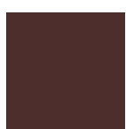
Dark Chocolate Brown PMS 412 C