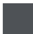
Iron Grey PMS 7540 C