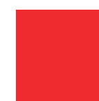
True Red PMS 187 C