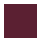
Maroon PMS 504 C