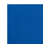
True Royal PMS 7687 C