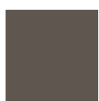
Brown Taupe PMS 405 C