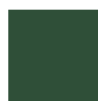
Forest Green PMS 553 C